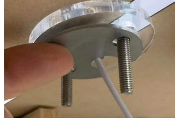
5) Slide metal backing plate against spacer