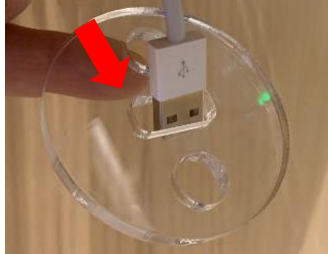
3) Slide power cable into center slot of spacer (underside of fixture)