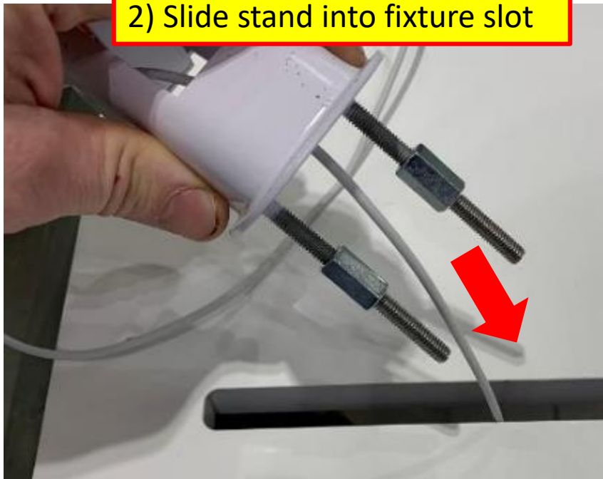
2) Slide stand into fixture slot